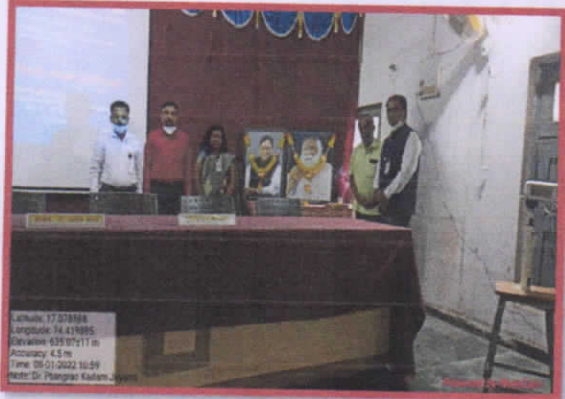
Inauguration of a webinar by offering floral tribute