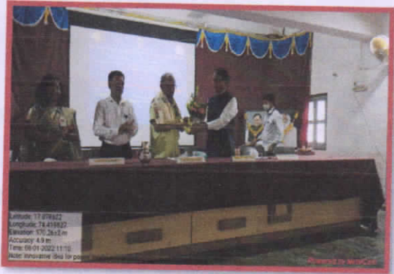
Felicitation of Chief Guest with bouquet