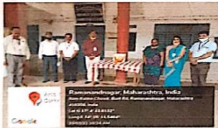
Dignitaries paying homage to the brave martyrs Bhagat Singh, Sukhdev and Rajguru

Social distancing and use of mask was mandatorily followed by all the attendees during the function. It is duty of every single citizen of the nation to root patriotism in their minds and be proud to be a citizen of the nation that holds the history written by young blood of Martyrs like Bhagat Singh, Sukhdev Thapar and Shivaram Rajguru and many others.