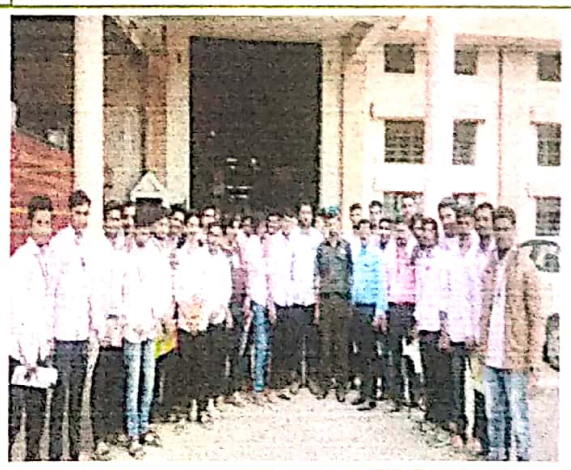
Industrial Tour at Kranti Agrani G. D. Bapu Lad Sahakari Sakhari Sakhar Karkhana, Kundal Dist: Sangli 29th Jan. 2019.