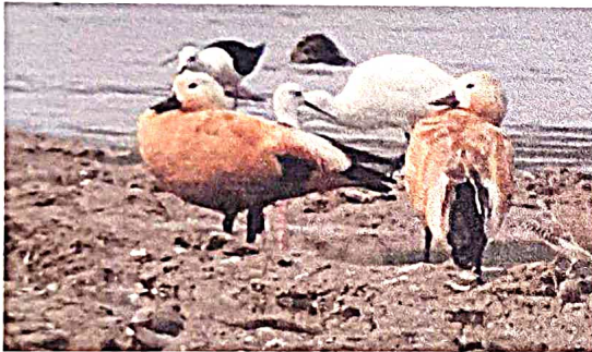
Rudy Shield Duck