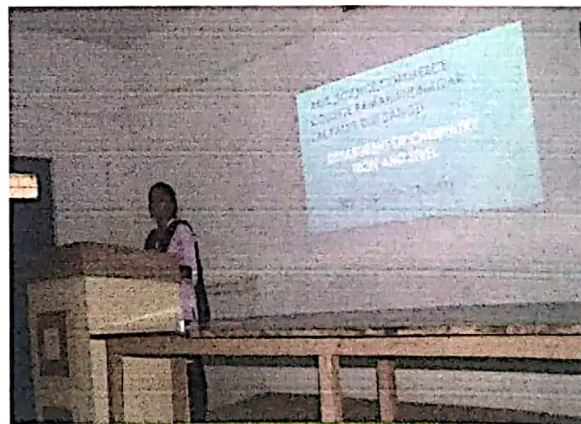
Students Delivered Seminar by using PPT