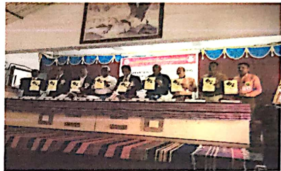
Publication of Abstract book