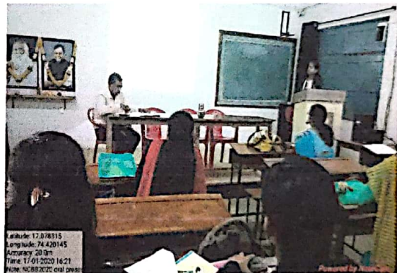
Oral Presentation Session