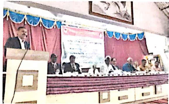
Inauguration of NCCBB-2020