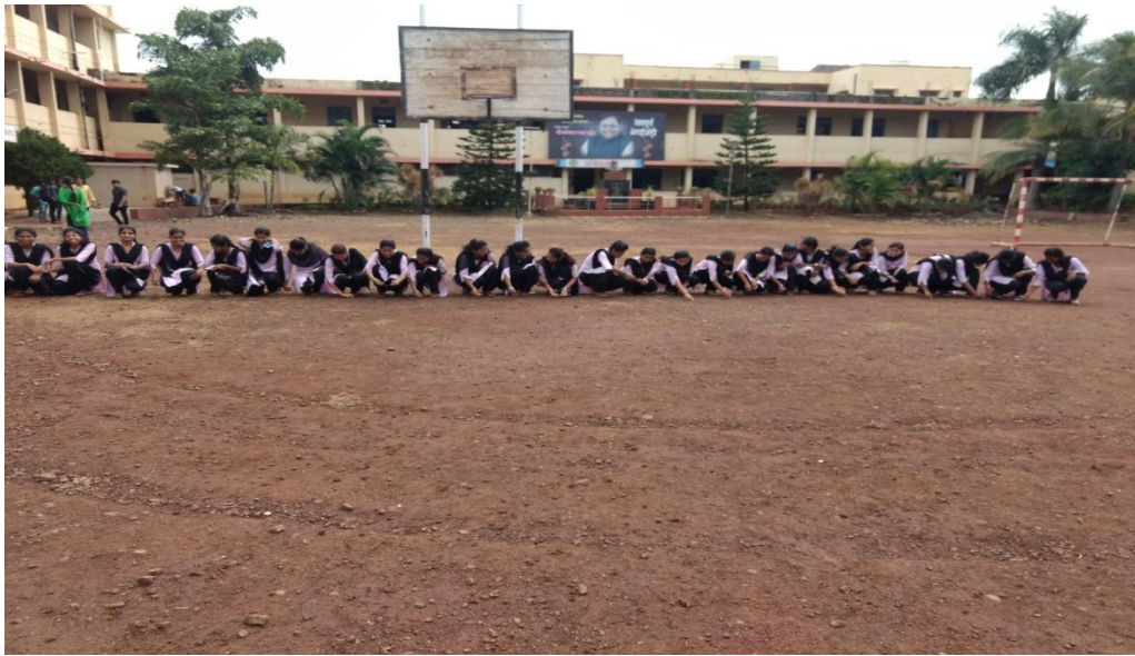
College Ground Cleaning