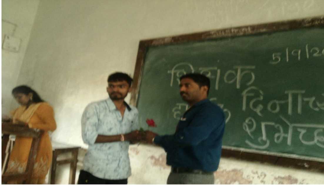
TEACHER DAY CELEBRATION BY THE STUDENTS