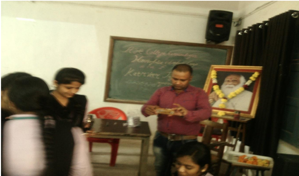
HB AND BLOOD CHECK UP PROGRAMME