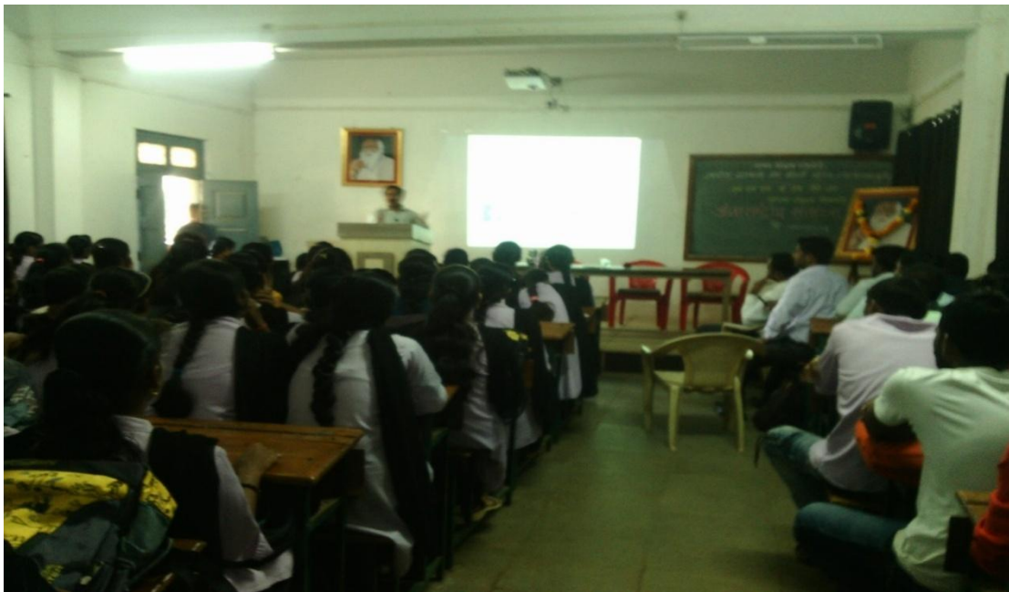
DIGITAL LITERACY DAY