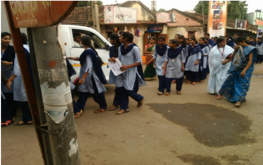
KARMVEER JAYANTI RALLY