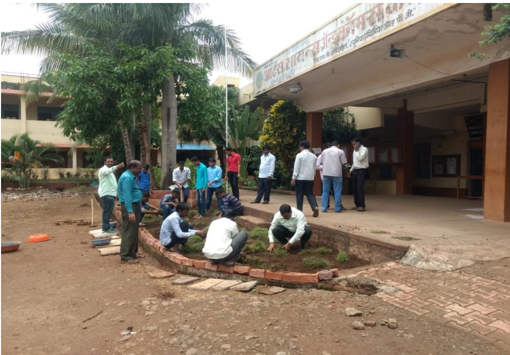
PREPARATION OF LAWN